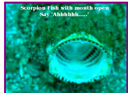
Scorpion Fish with mouth open Say "Ahhhhh....."

up of a Scorpion Fish, and below a yawning Scorpion Fish is captured at just the right moment. Both were taken using a Olympus C-4040 zoom camera with a DS-50 sub-strobe and a Ikelite housing. These are terrific images and a big thanks to JJ for sharing them with us.